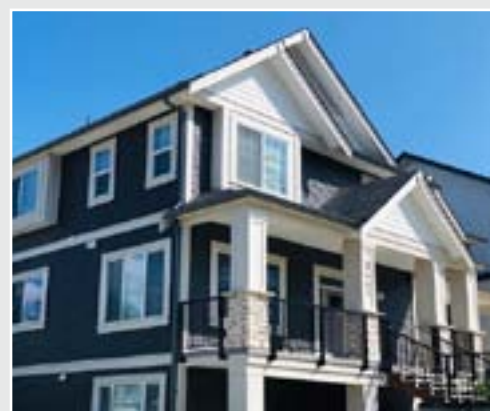
Vinyl & Aluminum Siding Accessories