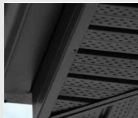
Vinyl & Aluminum Soffits